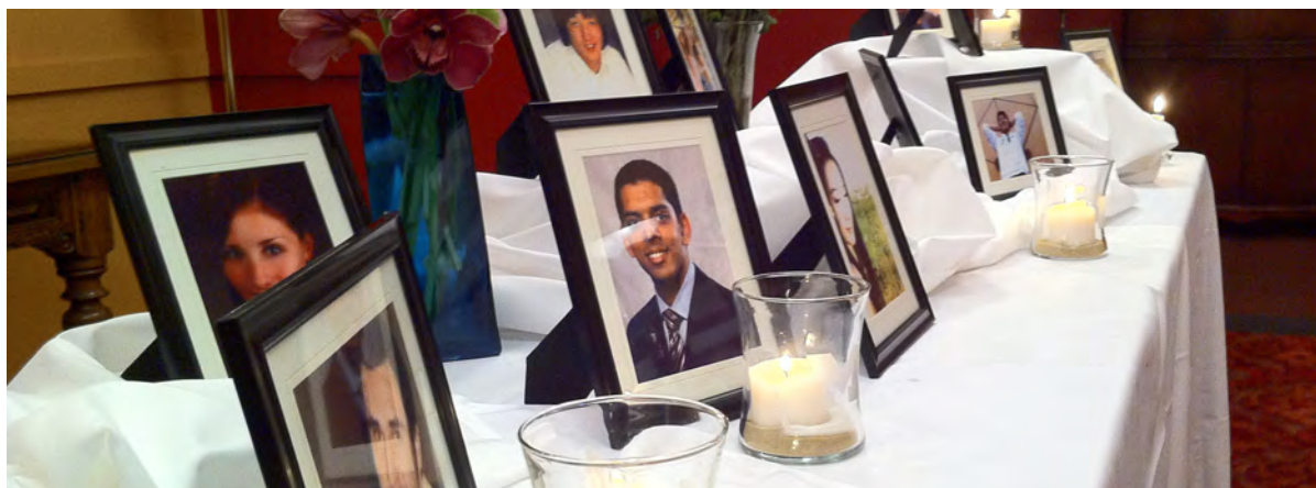
Table at the memorial service commemorating the lives of deceased students.